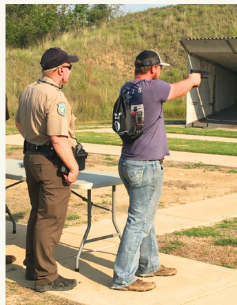
Participant practicing live range skills and safety instruction.