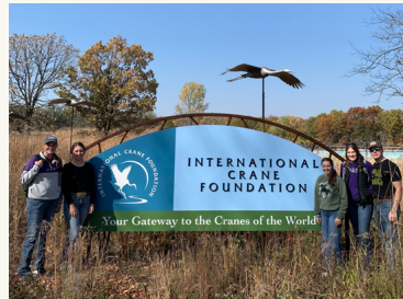
◀ International Crane Foundation; Baraboo, WI.