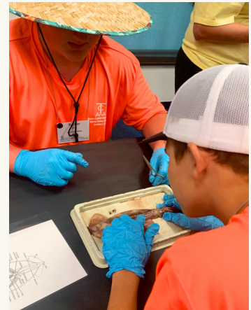
Participants engage in a squid dissection demonstration with Volunteers from Sea Turtle, Inc.